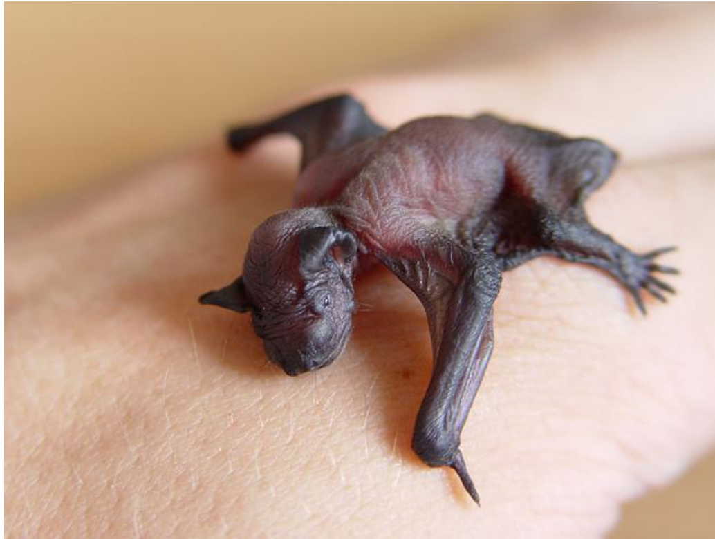
Image by Marcus Nolf reproduced under terms of GNU free public documentation licence