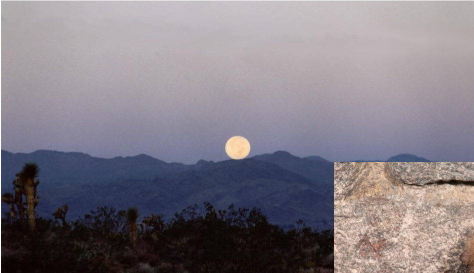
Mountain moonset